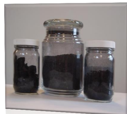
Biochar produced by MAGS (Up to 95% volume reduction)